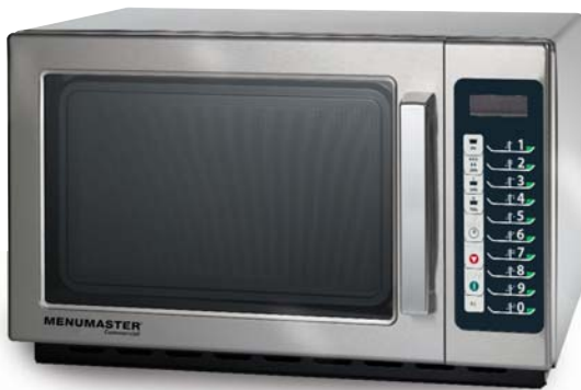
Model RCS511TS shown